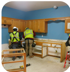
SAINT PAUL COLLEGE & CARPENTRY