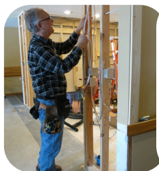
FRASER MORRIS ELECTRIC